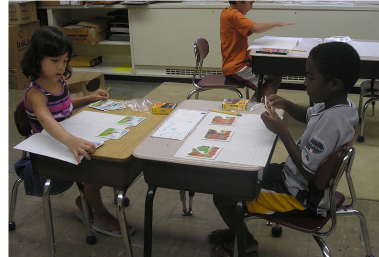
Summer academy students put pictures in the correct sequence before writing a story.

This summer proved to be a great opportunity for students in grades K-7 to continue making strides in their reading development. WASD hosted a four-week Summer Reading Academy to give students the opportunity to practice reading skills in a small group environment. The program had 88 students enrolled with nine teachers. Several students made enough progress to “graduate” from their current intervention program and move onto the next level, and six students reached the benchmark goal and no longer require interventions this school year. This was very rewarding for teachers