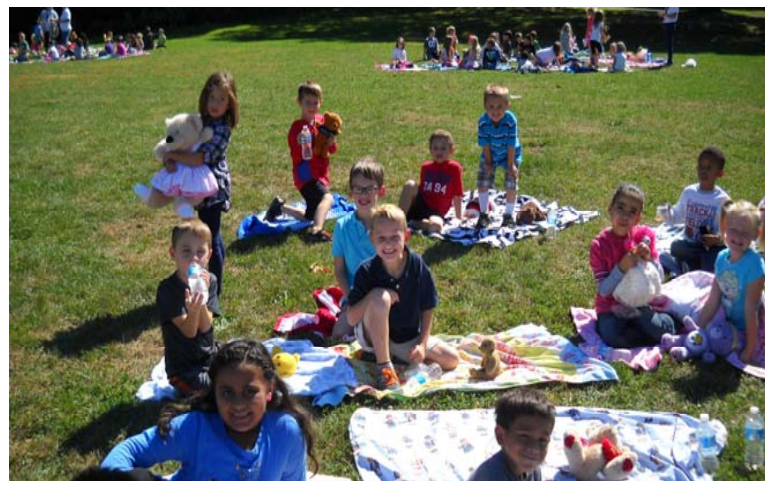
First grade classes spread out on the lawn at WHEC for the annual Teddy Bear Picnic.