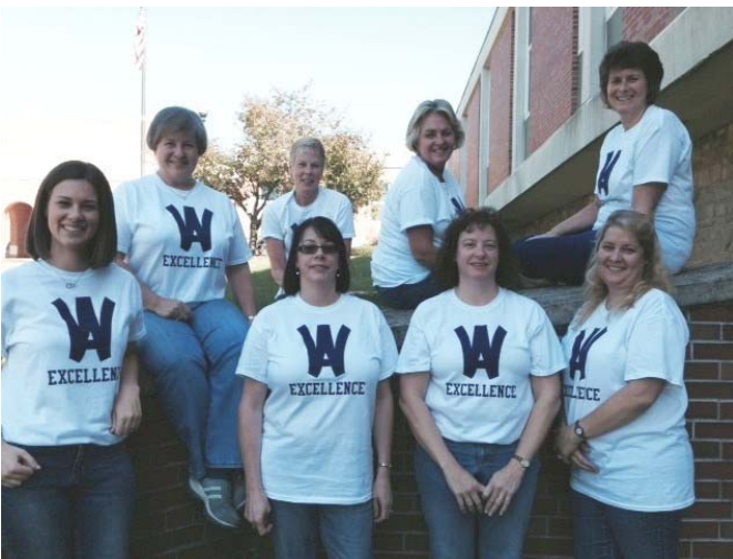
District Office Staff