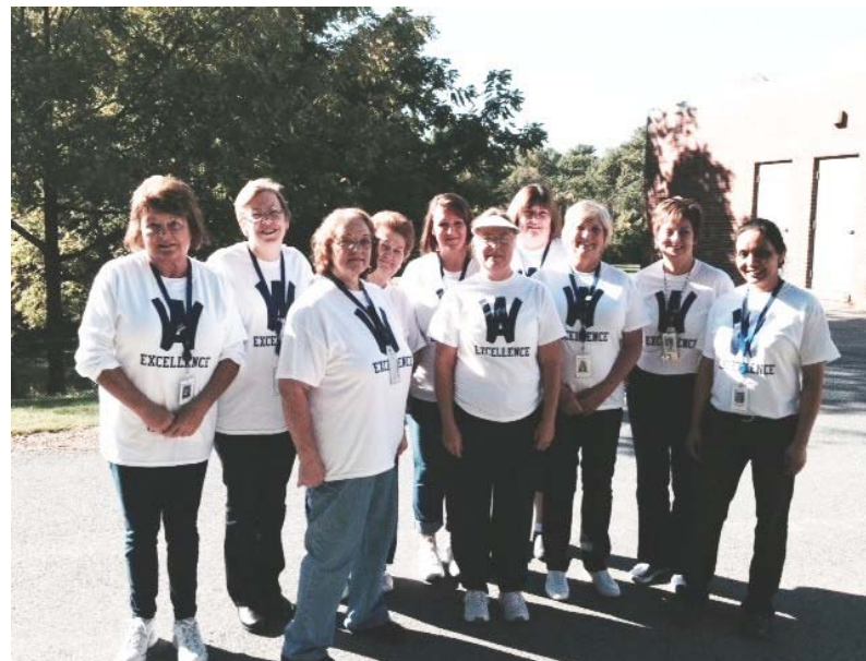
JSHS Food Service Staff